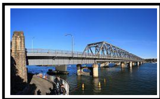
Tom Ugly's Bridge

The Park Royal Parramatta (02 9689 3333)