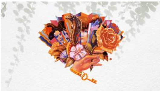
The Secret Garden Musical

“WOW” Do we need to write an itinerary..... Well here it is!