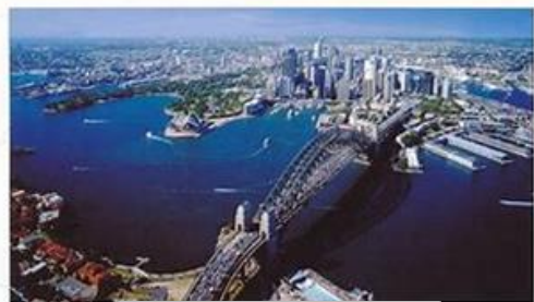
Views of Sydney Harbour